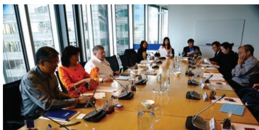
ASIF AGM held at FINSIA Board room, 26 October