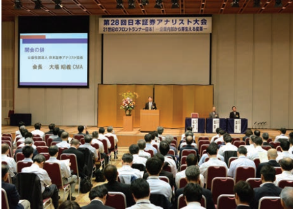
Opening Session, SAAJ Annual Conference