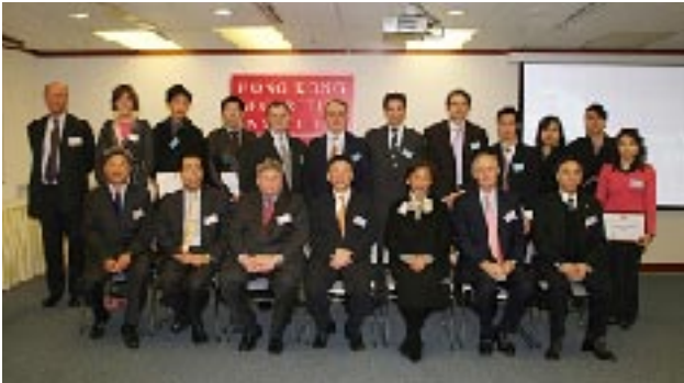
“Recognition of Top Performance — the Outstanding Achievers and the HKSI Board of Directors”

Since the launch of the Outstanding Achievers Awards Scheme in 2005, candidates have been recognised for their outstanding performances in the LE.